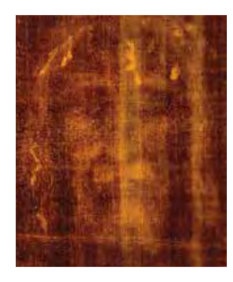
THE HOLY FACE OF JESUS CHRIST IS SHOWN IN THE CATHEDRAL OF SAINT JOHN THE BAPTIST IN TURIN, ITALY.

However, a later version of the legend from the 6th century (Acts of Thaddeus) recounts that the image was not a painting but a burial